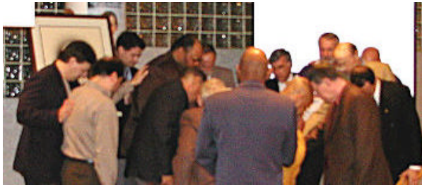
More than a dozen pastors participated in the dedication of Gateways new sonogram machine sonogram